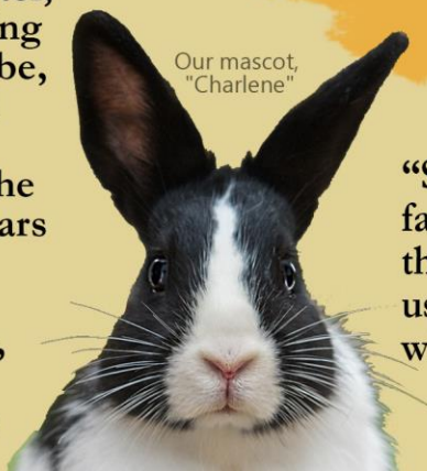
Our mascot, “Charlene”

“Steinbeck’s character work is fascinating. His stories focus on the people in life whom most of us overlook—those who are faced with the gravest challenges.”